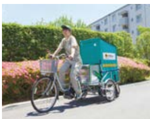
Electric bicycle with attached rear car

Climate change is one of the highest priority issues facing international society. The Yamato Group believes that climate change can lead to an increase in areas where it would be difficult to sustain the TA-Q-BIN business. This increase stems from higher costs related to stricter environmental regulations on facilities, vehicles, and fuel as well as the effects of abnormal weather. Under the “eco in transport” and “eco in facilities” sections of its statement on environmental protection policies, the Group is introducing low-emission vehicles and utilizing hand-pushed trolleys for pickup and delivery. The Group is also promoting other energy conservation efforts and working to mitigate climate change risks, thereby enhancing the continuity of its services. Furthermore, the Group is focused on switching to low-emission vehicles and other similar efforts, which it views as important measures for controlling air pollution.