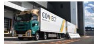
Super-Full Trailer 25

To provide more efficient trunk-route transportation to major cities, Yamato Transport has introduced the Super-Full Trailer 25 (a 25 meter long connected trailer) for the first time ever in Japan, and commenced its operations between Atsugi Gateway , Chubu Gateway , and Kansai Gateway . Through such methods, we are working to enhance the efficiency of trunk-route transportation and reduce CO 2 emissions.